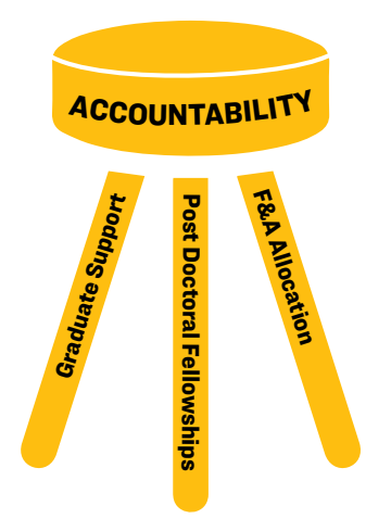
FIGURE 2. The three components of the recommended strategy for U of I to achieve R1 classification. These are post-doctoral scholar support, graduate student support, and F&A funds reallocation to researchers, with leadership and faculty accountability for execution and desired results.

The strategy the Working Group supports emphasizes investment in these three areas: (1) support for postdoctoral scholars, (2) support for graduate students, and (3) reallocation of F&A funds. Specifically, this proposed strategy for U of I to achieve R1 status consists of the following actions: