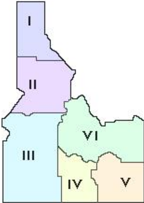
Figure 1- Original Six Statistical Regions in Idaho (State Department of Education)