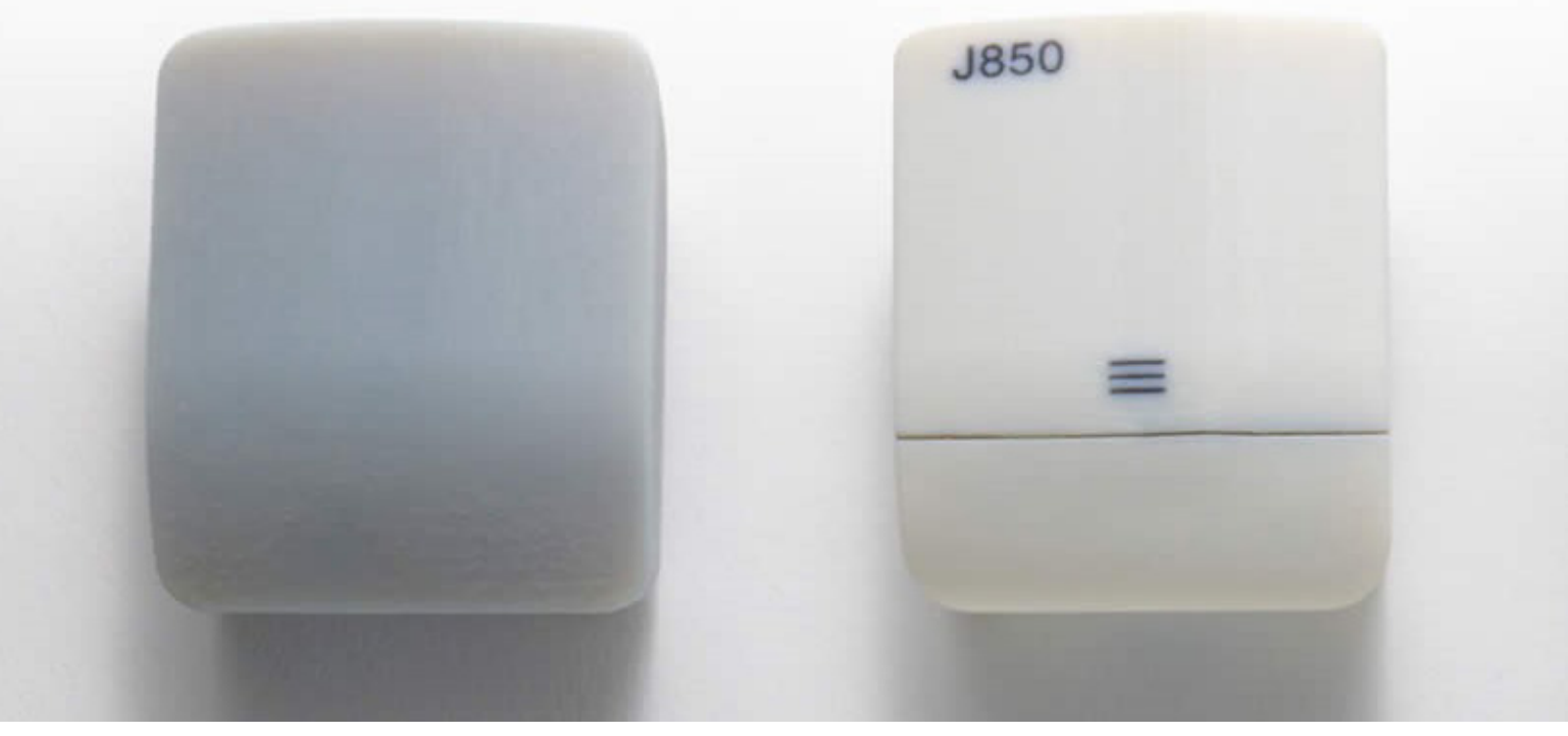
Earbud case prototypes 3D printed with DraftGrey (left) and VeroPureWhite (right)