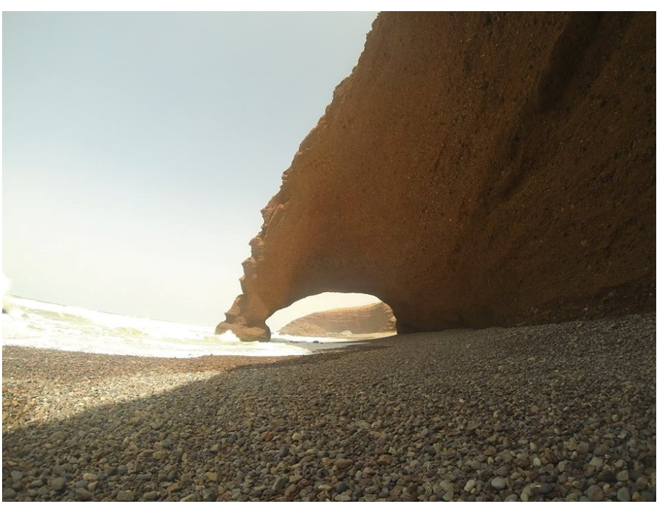
Rock arches at Legzira, Morocco. I visited these during spring break and was almost caught when the tide came in.

The semester had its challenges: expected things like homesickness, difficulty keeping in touch with friends and family, embarrassing language moments and general feeling of having no idea what is going on; as well as unexpected things like adjusting to the difference in school structure, to having a roommate for the first time, and missing Mexican food intensely. Honestly the biggest challenge for me, which I did not expect, was coming home. It didn't hit me until I