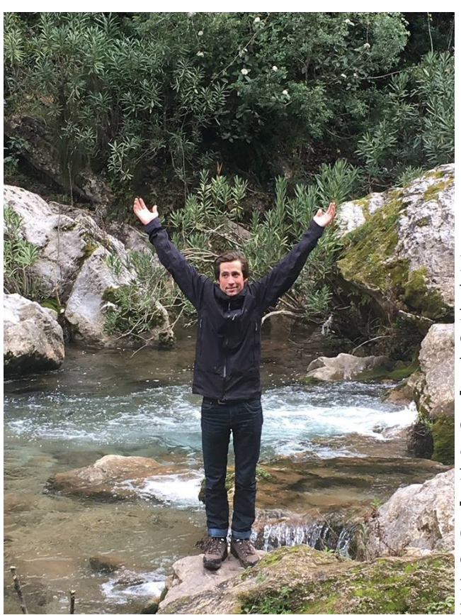
On a mountain hike in Chefchaouen, Morocco.