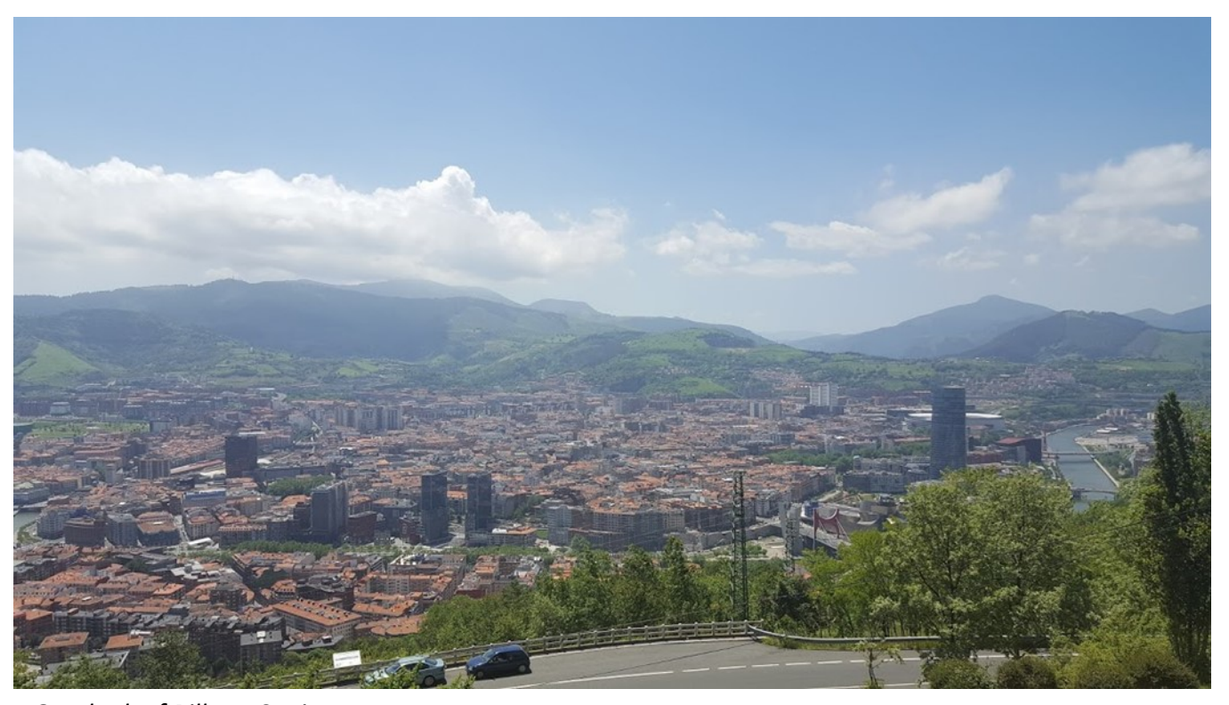
Overlook of Bilbao, Spain

For anyone who has taken ART100 through the University of Idaho, Bilbao, Spain is likely most known as the third answer for question 25; the location of the Guggenheim Museum designed by Frank Gehry. Fortunately, I came to know Bilbao as more than an answer to a 100-level test taken during my fourth out of five years at the university.