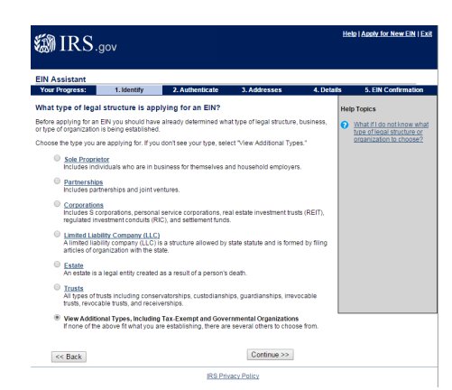
Step 3: select" View Additional Types..."

Step 4: University organizations typically selected one of the following: Bankruptcy Estate (Individual), Block/Tennant Association, Memorial or Scholarship, Political Organization, PTA/PTO or School Organization, Social or Savings Club. Select the option that most resembles the function of your club.