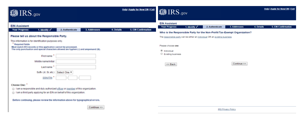
Step 5 : you may be asked to fill out additional identity forms.