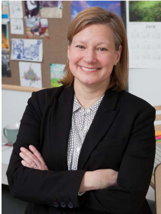
Leslie Goodyear Education Development Center AGEP Evaluation Capacity Building Conferences (AGEP ECBCs)