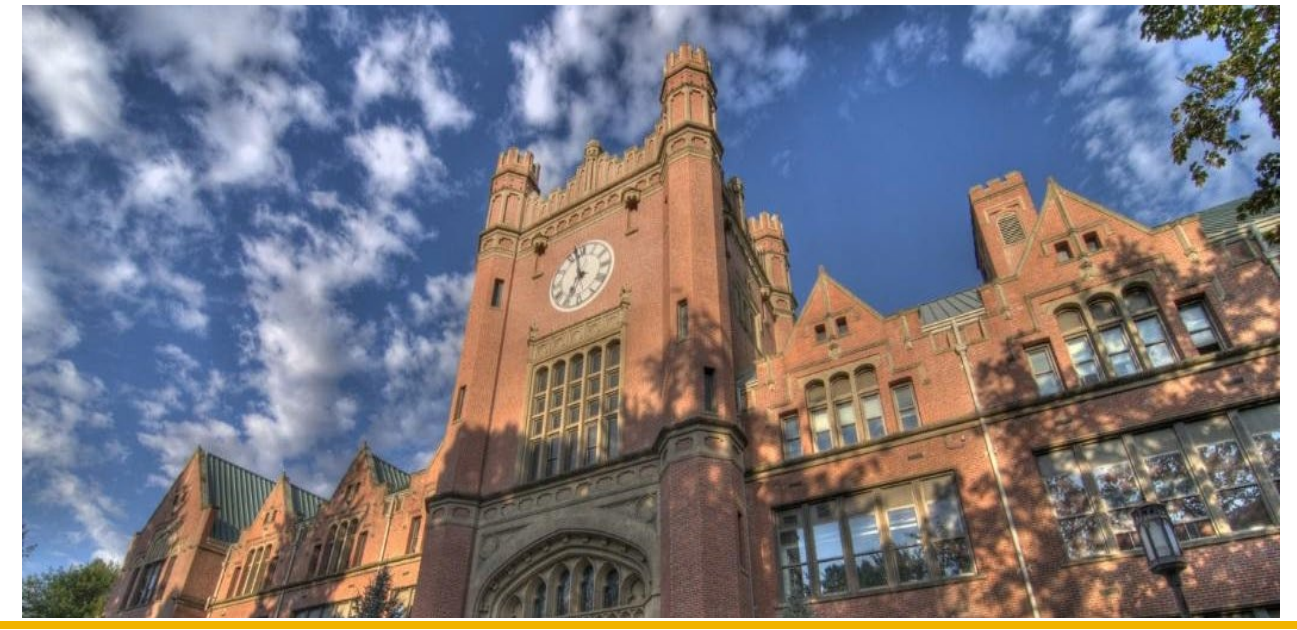
College of Education, Health & Human Sciences Doctoral Handbook - effective Summer 2022

Teaching Assistantship (TA) : Full-time teaching assistantships require 20 hours of work per week. Primary responsibilities are to involve teaching or activities that support teaching. Teaching assistantships are awarded per semester and usually start with the fall semester. See also Assistantship.