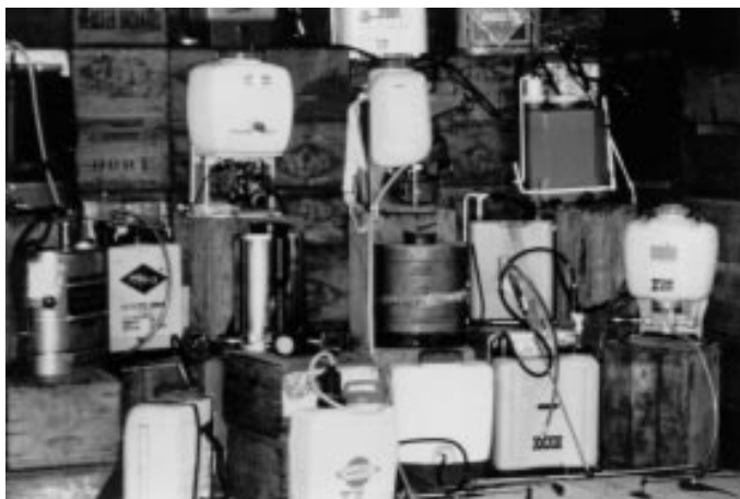
Figure 2.—A wide variety of sprayer types is available.