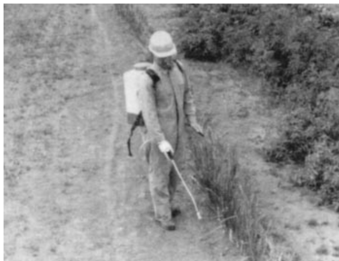
Figure 1.—Backpack sprayer application.

You can spray many acres with a backpack sprayer; however, the effort of carrying the spray mix and walking over each area you spray takes its toll on your strength and enthusiasm.