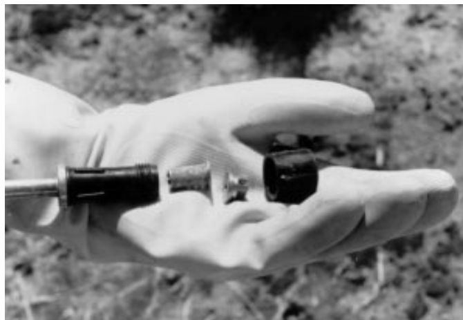
Figure 3.—Typical nozzle assembly.

Screens are needed in advance of the spray tips to reduce clogging. The smaller the tip opening, the