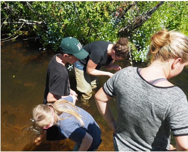
Team testing water at a summer camp (Jim Ekins, 2017)

Very high water at Driggs (Jim Ekins, 2017)