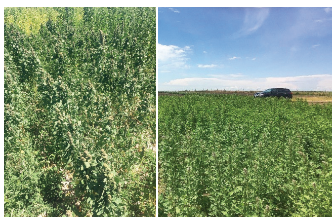
Figure 9. Poor quinoa stand due to weed pressure (left); a good quinoa stand (right).

Decision-making should thus incorporate environmental requirements (e.g., temperatures, precipitation, weed populations, and species compositon, etc.) and compulsory management practices (e.g., irrigation, cultivation, etc.) as well as consider the availability of effective herbicides.