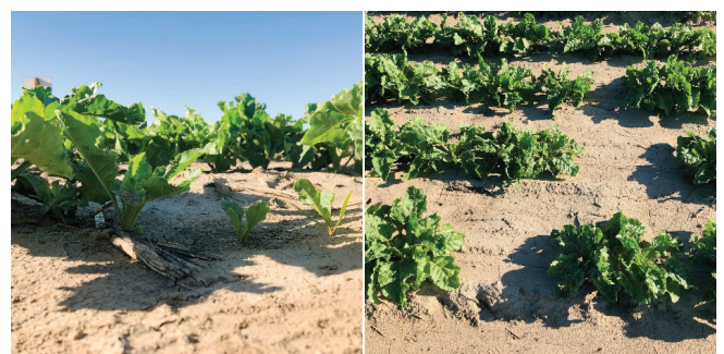
Figure 4. Delayed emergence and within-row plant skips in sugar beets.

defoliation and a lower price per ton, thus reducing revenue. Studies have shown that poorly defoliated sugar beets have lower Clear Juice Purity and poor storability.