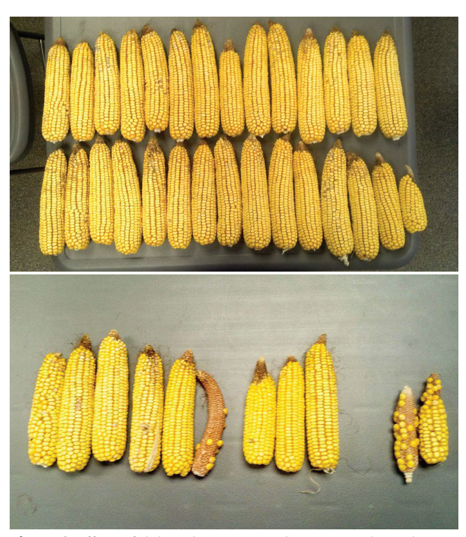
Figure 2. Effect of delayed emergence in corn-on-the-cob development and grain production.