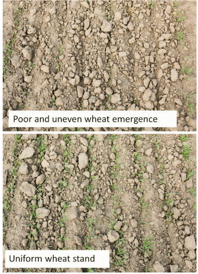
Figure 5. Contrasting winter wheat emergence under conditions of limited precipitation and inadequate soil moisture.

Precision-planted cereal crops (soil coverage is uniform for all seed) typically have a more uniform emergence, and are easier to manage, resulting in a higher grain yield. Seeding depth in barley is particularly important, as deeper planting can decrease the stand uniformity and potentially lead to decreased plant vigor.