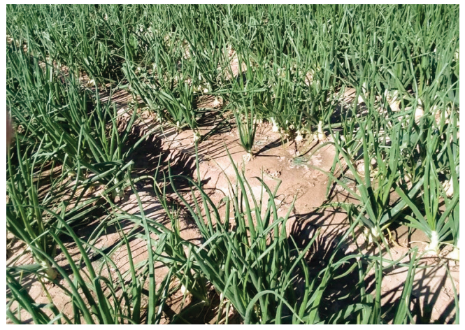
Figure 7. Poor stand establishment in onions.

Cultural practices and field management are extremely important for onions (Figures 7 and 8). For example, too much space around an onion plant