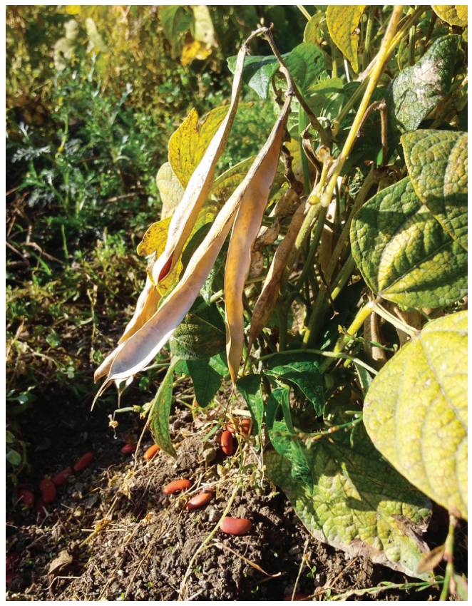
Figure 3. Bean pods shattering and dropping seed prior to harvest.

Planter speeds of 3 mi/hr have been shown to result in minimum bean seed cracking, maximum uniformity of bean plant spacing, and the highest