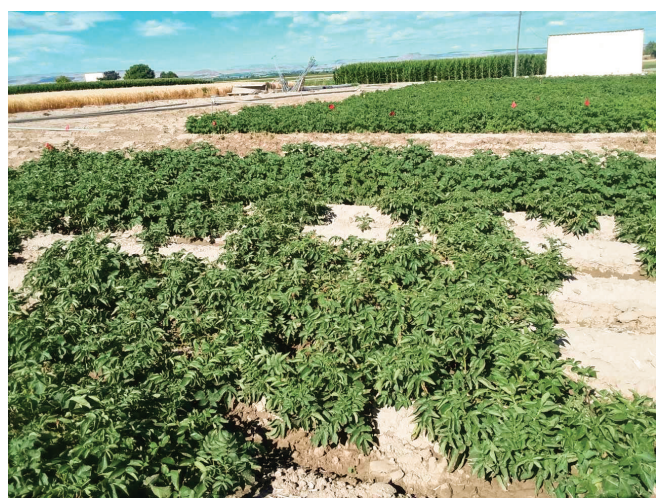
Figure 6. Poor plant stand in a potato field.

Potato seed-piece profiles must be monitored to obtain the desired average seed-piece size. To obtain uniform plant populations, potato growers are encouraged to plant certified seed that is effectively sorted by size prior to cutting. Adjusting the cutting mechanisms, discarding undersized seed pieces, and hand trimming oversized seed pieces can greatly improve planter performance.