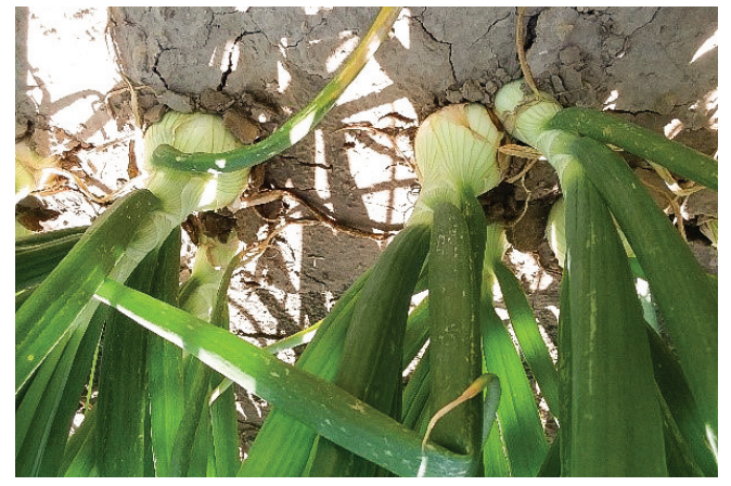
Figure 8. Small onion size on the right due to crowding. At left, onion with thicker neck due to too much room.

often results in thick necks, while crowding of onion plants results in small bulb size. After seeding, the soil should be kept moist to enhance germination and successful and uniform early seedling development. Indequate soil moisture has been shown to reduce seedling emergence (Finch-Savage and Phelps 1993).