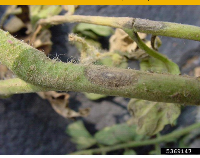
Early blight on stems.