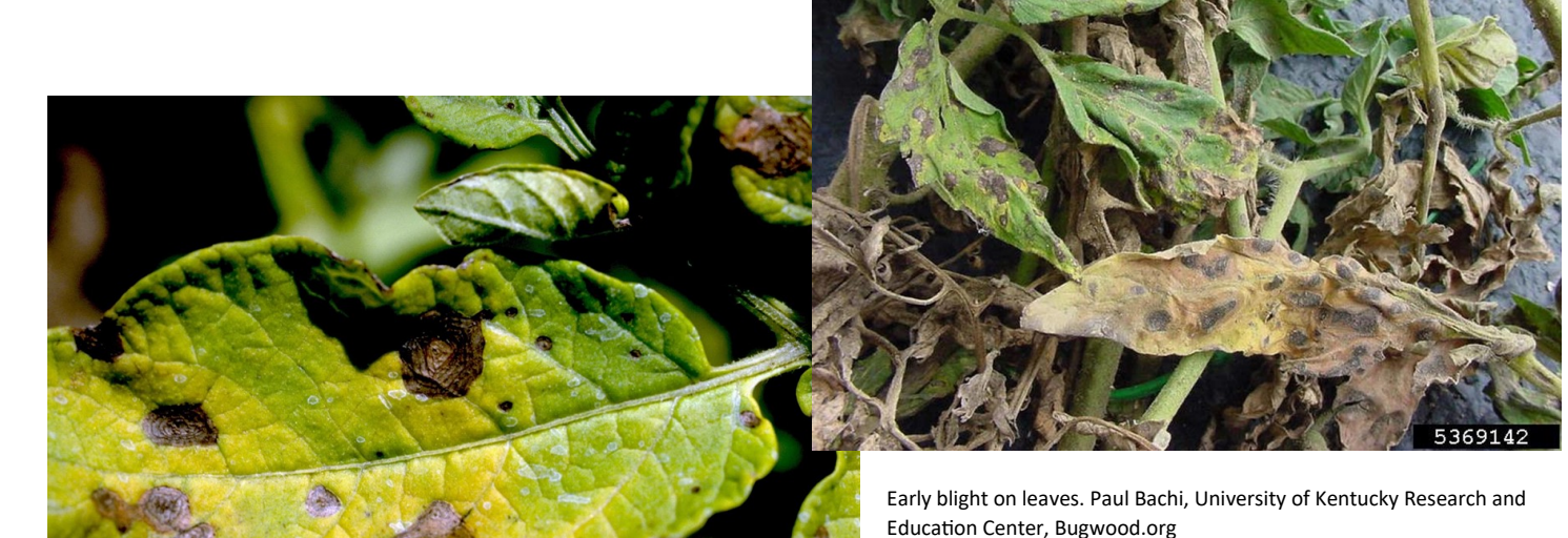
Early blight on leaves.

eventually fuse together, forming irregular dead patches on the leaves. The stems develop brown, dry, sunken lesions.