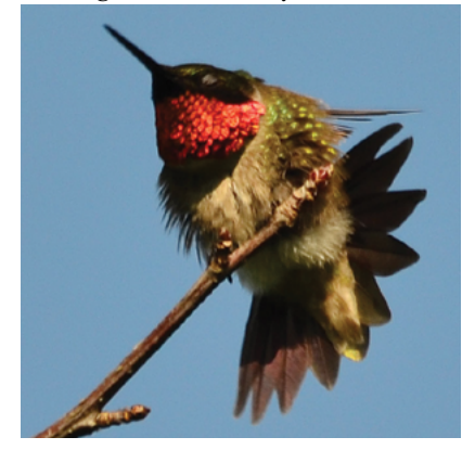
Ruby-throated Hummingbird—male

Although small numbers of ruby-throats historically overwintered in southern Florida and on the Gulf Coast, in recent winters they have become increasingly common northward to North Carolina's Outer Banks and, in some cases, even at inland locales in the southern U.S. (Most winter hummingbirds in the eastern U.S. are western