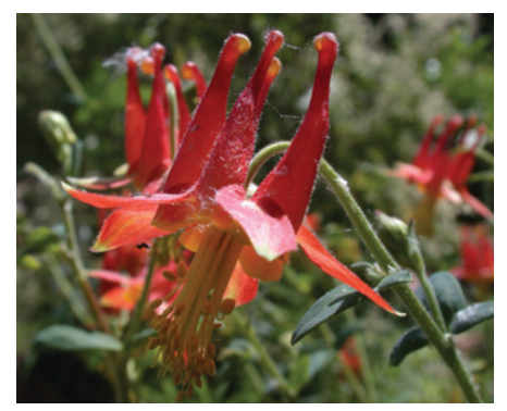
Western columbine—Aquilegia formosa

Hummingbirds feed by day on nectar from flowers, including annuals, perennials, trees, shrubs, and vines. Native nectar plants are listed in the table near the end of this guide. They feed while hovering or, if possible, while perched. They also eat insects, such as fruit-flies and gnats, and will consume tree sap, when it is available. They obtain tree sap from sap wells drilled in trees by sapsuckers and other hole-drilling birds and insects.