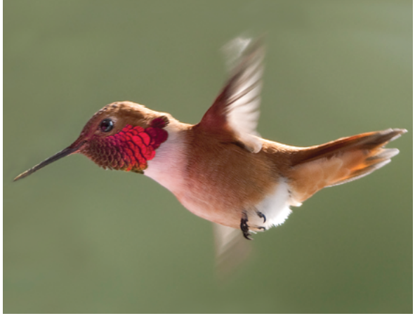
Rufous Hummingbird—male

NESTING—For breeding, they prefer second-growth forest, including clearcuts, burns and gaps. They will also use mature forests, parks, and residential areas from sea level to 6,000 feet. Spring migration is mostly along the Pacific Flyway.