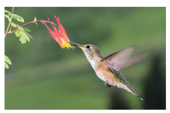
Broad-tailed Hummingbird—female

variety of mountain habitats including piñon-juniper, pine-oak, montane riparian areas and wet meadows, and areas of open mixed conifers including fir, spruce, and pine, typically at higher elevations than Black-chinned Hummingbird; these two species have only a narrow range of overlap around 6000 feet. The Broad-tailed Hummingbird occurs in BCRs 9 and 10 in Idaho and Montana, and is generally not found in North Dakota. It spends the summers breeding in southern Idaho and parts of western and southern Montana. It winters as far south as Guatemala.