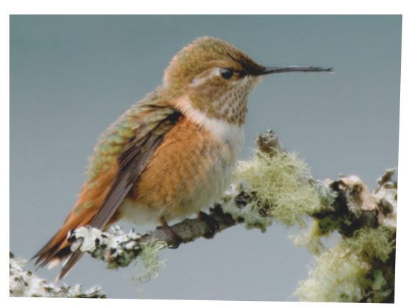
Rufous Hummingbird—female

RANGE—The Rufous Hummingbird travels farther north than any other hummingbird, wintering in Mexico and migrating to breeding sites as distant as Alaska. Although a relatively small hummingbird, it has an aggressive nature and frequently chases larger hummingbirds from nectar sources. It is an important pollinator in the cool, cloudy Pacific Northwest, where cold-blooded insect pollinators are at a disadvantage. They begin arriving in western Washington in March. East of the Cas-