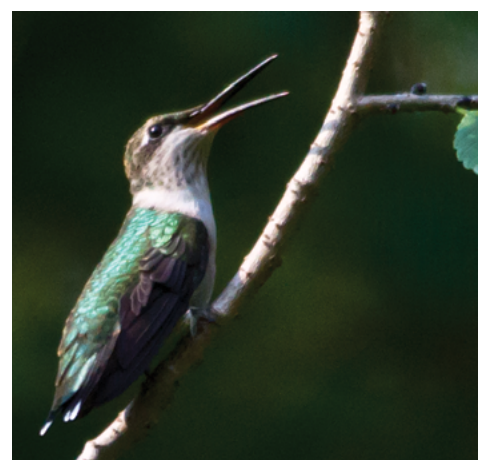
Ruby-throated Hummingbird—female

species, especially Rufous Hummingbirds.) With their vast distribution across North and Central America, Ruby-throated Hummingbirds are arguably the most abundant