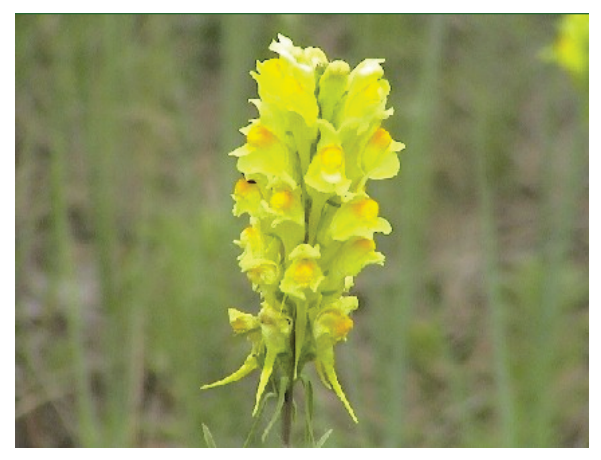
Yellow Toadflax

The following table (Hummingbird Nectar Plants for Ecoregions in Idaho, Montana, and North Dakota) lists some plants that are nectar sources for hummingbirds. These plants are native to Idaho, Montana, and/or North Dakota, and are adapted to conditions in the ecoregions indicated in the table. The table also provides basic information on habitat and light, soil, and water needs. Finally, the tables provide seed sources for each plant valid as of July 2015. A directory of the seed sources follows the tables. Use locally-adapted genetically appropriate plants in all your restoration and pollinator enhancement work. Seed zones—areas with genetically similar plants—help determine the right plant materials to use; poorly chosen plants usually fail to thrive. See http:// fs.bioe.orst.edu/web_maps/S_Zones_1Oct2013.html for provisional seed zones of Idaho, Montana, and New Mexico, and select plant materials from your zone. Planting non-natives to attract hummingbirds is against policy and destructive: these plants become invasive and disrupt ecosystems. For example, yellow toadflax (Linaria vulgaris, also called "butter and eggs") is attractive to hummingbirds but is a noxious weed.