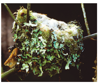
Rufous Hummingbird nest

Hummingbirds play an important role in the food web, pollinating a variety of flowering plants, some of which are specifically adapted to pollination by hummingbirds. Some hummingbirds are at risk, like other pollinators, due to habitat loss, changes in the distribution and abundance of nectar plants (which are affected by climate change), the spread of invasive plants, and pesticide use. This guide is intended to help you provide and improve habitat for hummingbirds, as well as other pollinators,