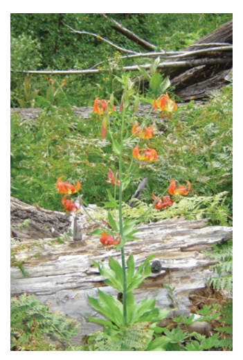
Wildflowers in meadow.

The hummingbird species of Idaho, Montana, and North Dakota are migratory, leaving in August to go to the wintering grounds in Mexico and returning to the US in April and May. Black-chinned, Calliope, Rufous and Broad-tailed hummingbirds breed in Idaho and Montana, while the Ruby-throated Hummingbird breeds in Eastern North Dakota. For hummingbird species to thrive, they need to find suitable habitat all along their migration routes, as well as in their breeding, nesting, and wintering areas. Even small habitat patches along their migratory path can be critical to the birds by providing places for rest and food to fuel their journey.