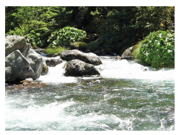
Mountain stream.

Hummingbirds get adequate water from the nectar and insects they consume. However, they are attracted to running water, such as a fountain, sprinkler, birdbath with a mister, or waterfall. In addition, insect populations are typically higher near ponds, streams, and wetland areas, so those areas are important food sources for hummingbirds.