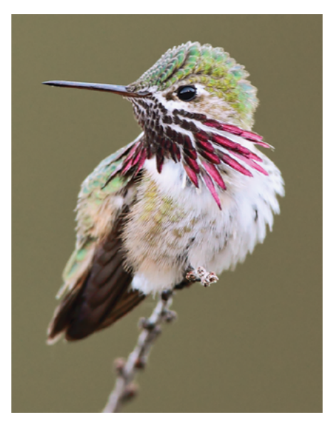
Calliope Hummingbird—male

The Calliope Hummingbird is the smallest breeding bird in North America and is the smallest long-distance avian migrant in the world. Calliope Hummingbirds occur in BCRs 9 and 10 in Idaho and Montana, and do not occur in North Dakota.