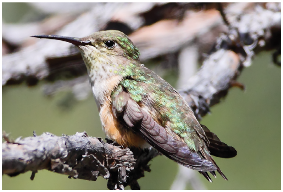
Calliope Hummingbird—female

NESTING—Preferred nesting habitat is montane conifer forests, primarily in shrub-sapling seral stage into second-growth following fires or logging, and usually near (within 1 mile) of riparian habitat. They breed mostly in mountain areas from British Columbia to California, Nevada, and Utah. They breed mainly at middle elevations (4,000 to 7,000 feet), but sometimes as high as timberline (above 9,000 feet) and down to lower forest margins (500 feet).