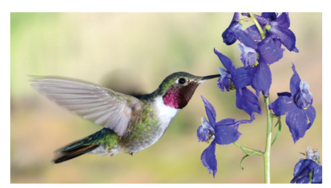
Broad-tailed Hummingbird—male

RANGE—The Broadtailed Hummingbird is a long-winged, high elevation hummingbird whose migratory breeding populations range north across the Rocky Mountains to southern Montana and west through forested regions of Nevada and just barely make it into eastern California. This species occupies a wide