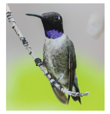
Black-chinned—male Courtesy of Scott Carpenter

RANGE—Black-chinned Hummingbirds occur in two Bird Conservation Regions (BCRs) in Idaho and Montana, which are BCR's 9 and 10, and do not occur anywhere in North Dakota. (See the Bird Conservation Regions section, below.) They are relatively common summer breeding residents throughout Idaho and the western edge of Montana, though occurring only transiently through central Idaho. In winter, they reside in the lowlands of western Mexico. They are most common in areas below 6000 feet and inhabit a variety of habitats associated with water (less than 1/2 mile), including canyons and gulches, riparian corridors, oak and cottonwood, and urban settings.