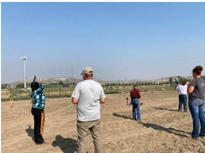
4-H members competing at the archery shoot at fair 2021.

4-H Working Groups utilize donated funds to cover costs of recognition such as trophies, plaques and buckles. You may designate your donation for a specific award or just donate to be used where needed. Sponsors are also welcome to come to the 4-H Awards Ceremony after our livestock sale on Saturday and present the award to the winner.