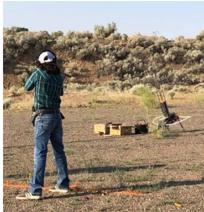
Member competing in 4-H rifle shoot at fair 2021

Web: www.uidaho.edu/extension/county/elmore