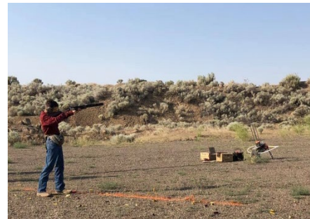
4-H member competing at the rifle shoot at fair 2021.

4-H Working Groups utilize donated funds to cover costs of recognition such as trophies, plaques and buckles. You may designate your donation for a specific award or just donate to be used where needed. Sponsors are also welcome to come to the 4-H Awards Ceremony after our livestock sale on Saturday and present the award to the winner.