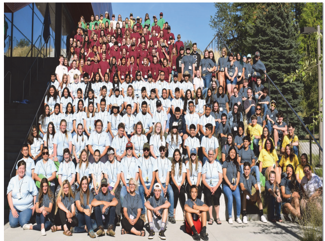
Delegates from the 2019 Idaho 4-H State Teen Association Convention.

Throughout the four days of the convention in 2019, youth (delegates) participated in activities geared towards career development and decisions about college or post-secondary education. This year STAC offered youth a wide variety of activities including career tours, keynote speakers, campus tours and multiple workshops. Youth attended workshops on college scholarships, probiotics, resumes and interviews,