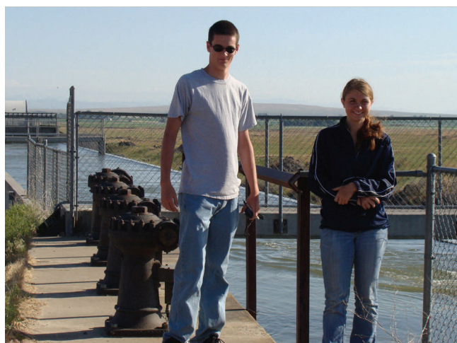
Teens used GPS units to collect canal headgates and canal lateral data in the Little Wood District of the Big Wood Canal system.