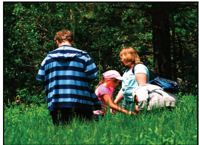
Bingham County 4-H Campers use teamwork during the nature hike at Alpine 4-H Camp.

The table summarizes the results of the evaluation for 2008-2010. Seventy-seven campers took the evaluation in 2008, 86 in 2009, and 72 in 2010. Results show that campers made new friends and developed closer friendships with people they already knew. They learned more about different subjects related to camping and the yearly themes. Between 75% and 86% of campers agreed or strongly agreed that they became more independent and able to take care of themselves while at 4-H camp. Campers reported feeling more self-confident and becoming more re-