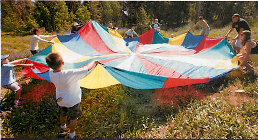
Parachute is one of the favorite camp activities.