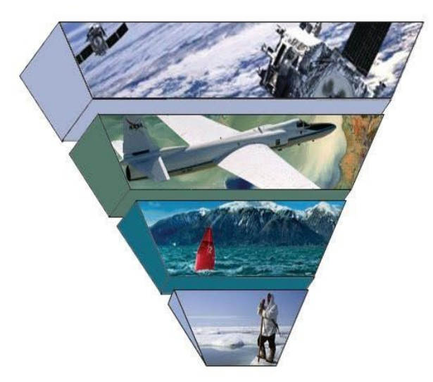
Figure 1. The integration of CBO into broader systems of environmental change observatories spans satellite observing, airborne observing, terrestrial and marine instrumentation

networks, and human observing networks. Data needs to be interoperable if efforts are to contribute substantially to a global understanding of change. Since communities, to a greater or lesser degree, embedded in a globalized teleconnected world, such an understanding is critical to provide place-based contexts to preparedness and adaptive responses that sustain livelihoods and allow can communities to thrive.