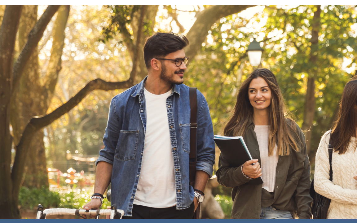
Use ISI courses to save money, begin college programs early, resolve on-campus scheduling conflicts, graduate on time, satisfy prerequisites, pursue professional development or for personal enrichment.