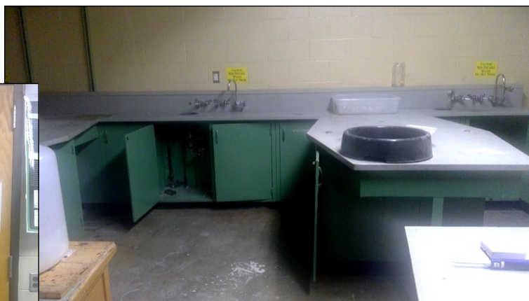
Photos: BEL 347, Original sinks, outside of the door which many of you probably remember, and lab fixtures.