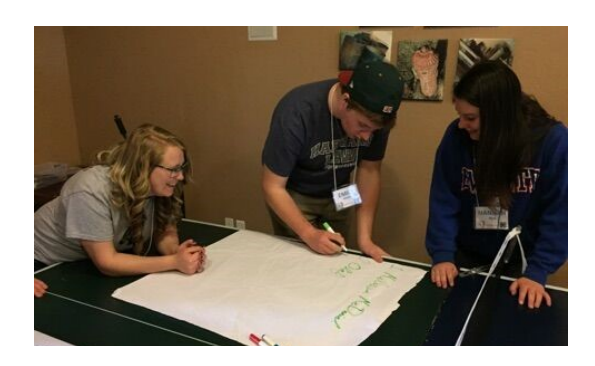
Make SMART goals and learn how to reach them!

This year's conference registration will be done electronically through 4-HOnline starting Dec. 1, 2015. Registration is limited to 48 youth.