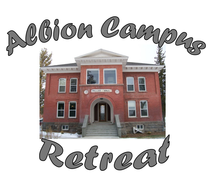
http://albioncampusretreat.com/ Visit online to see the facilities

This year's conference registration will be done electronically through 4-HOnline starting Dec. 1, 2015. Registration is limited to 48 youth.