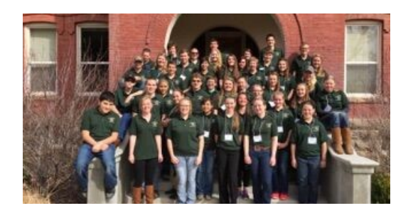
Learn how to plan and promote successful events.