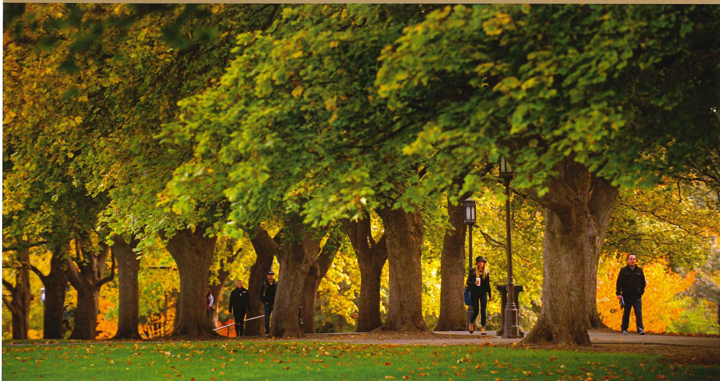
Beautiful Moscow campus in the Fall.