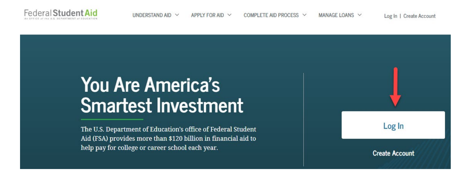
Step 1: Log in to StudentAid.gov using your FSA ID

* If you don't have an FSA ID, click Create Account and create one. You will need your social security number, full name, and date of birth available to create an account.