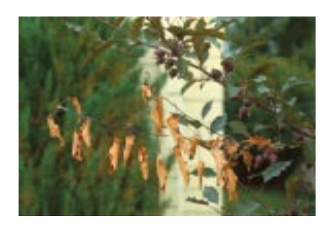
Figure 2: Blighted leaves on ornamental apple.