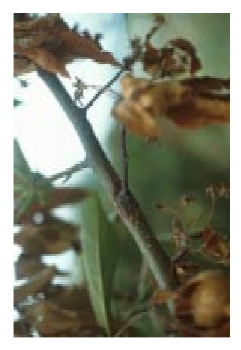
Figure 3: Sunken black canker on apple branch.