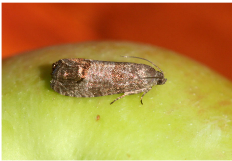
Figure 2. Adult codling moth.