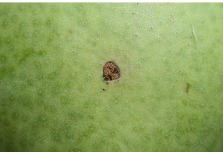
Figure 9. The original entry wounds made are quite small, but do indicate that a fruit is infested by a developing codling moth caterpillar.

older trees also provide pupation sites and these should be eliminated. Fruit that contain developing larvae should be picked and destroyed.