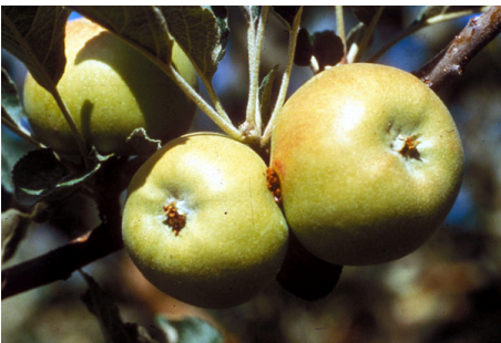
Figure 8. A common point where codling moth larvae will enter fruit is where two fruit are in contact. Thinning fruit to avoid fruit-to-fruit contact can help control the insect.