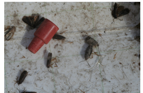
Figure 11b. Codling moth males trapped on the sticky surface of a pheromone trap. The red rubber septa contains the sex pheromone produced by the female.