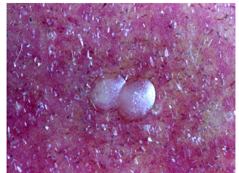
Figure 6. Eggs of the codling moth are laid on leaves or fruit.

identified by checking for 'stings' and other evidence of entry points. Infested fruit should be removed from the site as larvae will continue to develop normally in fruit that is merely dropped to the ground.