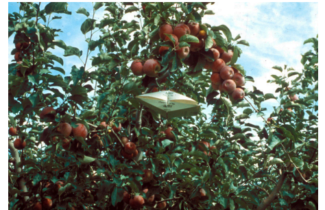
Figure 11a. A pheromone trap for codling moth, baited with the sex attractant produced by the female.