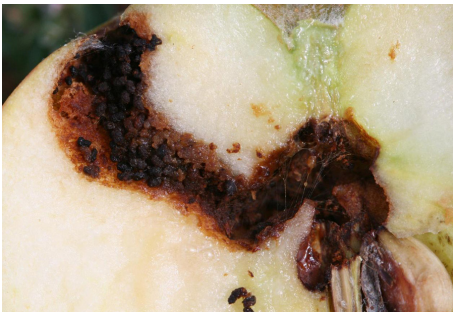
Figure 1. Tunneling of apple fruit caused by larvae of the codling moth.