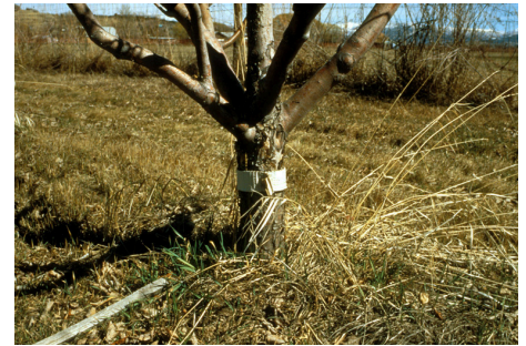
Figure 10a. Banding trunks of trees with cardboard or burlap bands can provide sites where codling moth will pupate. They can then be collected and destroyed.

Pheromone Traps. The sex pheromone produced by females to attract male moths can be produced and used as a lure (Figures 11a and 11b). These will attract males only