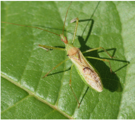
Figure 7. The assassin bug Zelus luridus is one of many insects that will feed on codling moth and other insects found in apple and pear trees.