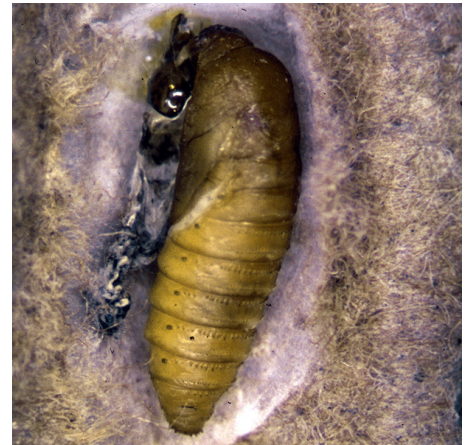
Figure 5. Pupa of a codling moth.