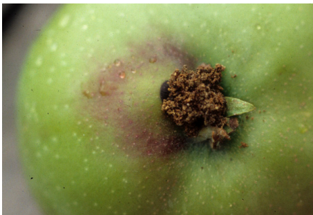
Figure 3. Excrement of a codling moth caterpillar expelled from point of entry near calyx end of an apple fruit.

larval stages (instars) before they become full-grown. The body of the growing caterpillars turns from creamy white to a slight pink color and the head and thoracic shield are brown or black.