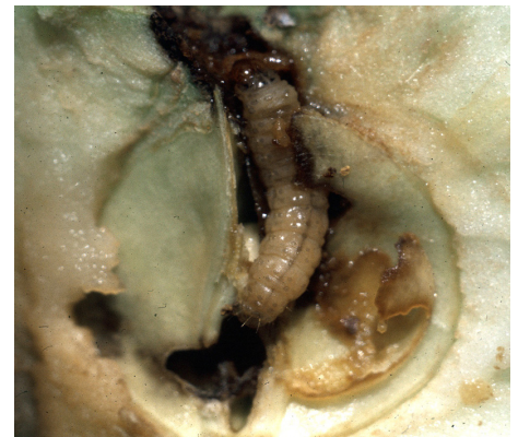
Figure 4. Late stage caterpillar of a codling moth feeding within an apple.

Fruit that is already infested and that still contain larvae should be picked and destroyed (Figure 9). These can be