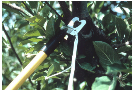
Figure 12. Twist-tie strips containing pheromone of codling moth being attached to branches for use in mating disruption within a commercial orchard. Large amounts of pheromone are emitted that can confuse male moths and disrupt mating.

Mating disruption for codling moth is widely used in apple and pear orchards and can be very successful under the correct circumstances. Pheromone emitting lures (e.g., IsoMate , No Mate , CheckMate ) are placed on fruit trees so that an area becomes permeated with the pheromone that is produced by the female to attract mates (Figure 12). This potentially prevents much of the mating, although areas around the periphery of orchards or orchards adjacent to nearby sources of mated females