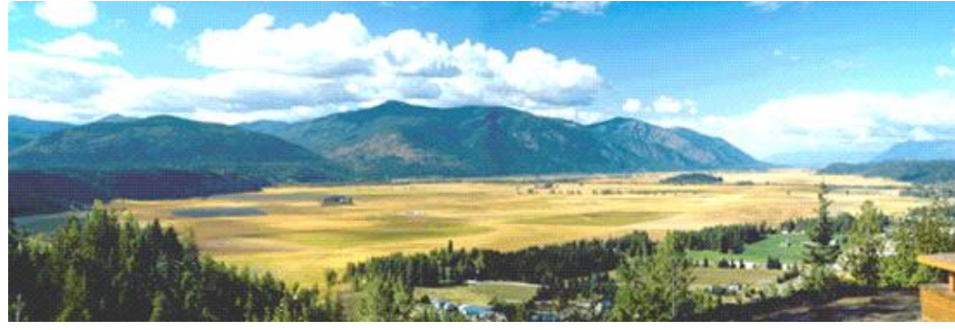
EXTENSION News = Fcs = Master Gardener = 4-H