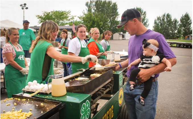
Canyon County 4-H volunteers serving pancakes at the Buckaroo Breakfast 4-H fundraiser.