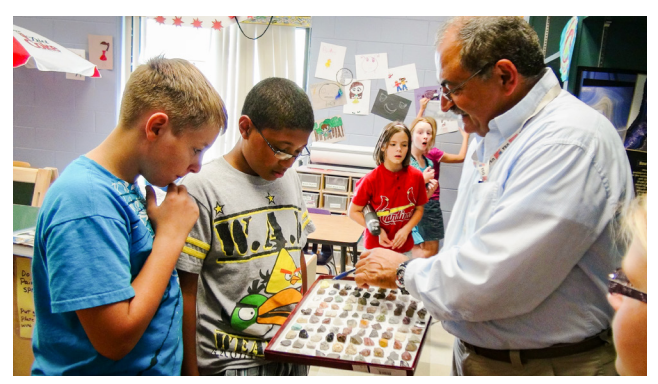
Rock hounds, Elmore County.

Occasionally, members and parents become so focused on the project and subject matter that they forget the importance that club meetings play in the overall personal development of the member. Leaders play an integral role in helping families focus on the importance of well-rounded youth involvement within 4-H.