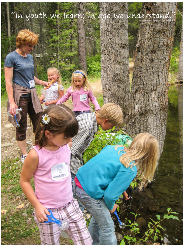
Quote from Marie von Ebner-Eschenback obtained from BrainyQuote.com.

University of Idaho Extension provides instruction and practical, research-based information in agriculture, home horticulture, natural resources, health and nutrition, food safety, financial management, youth development, and community development to all citizens. In addition, the university's resources can be requested to provide assistance in finding solutions to major issues within a community.