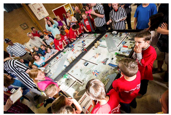
4-H Robotics: Learning STEM (science, technology, engineering, math).

• Encourage members to explore career opportunities and discover what educational training they require. Through these experiences, members get a taste for the work and responsibilities involved in a field.