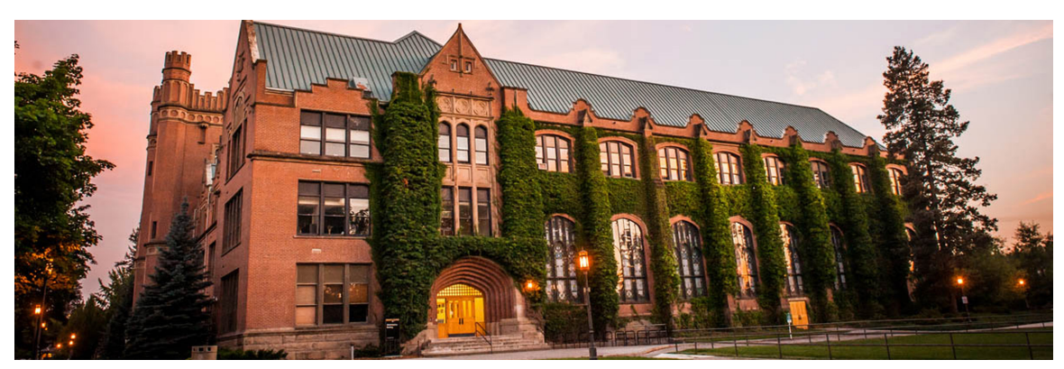
The University of Idaho campus in Moscow, home to the state 4-H office.