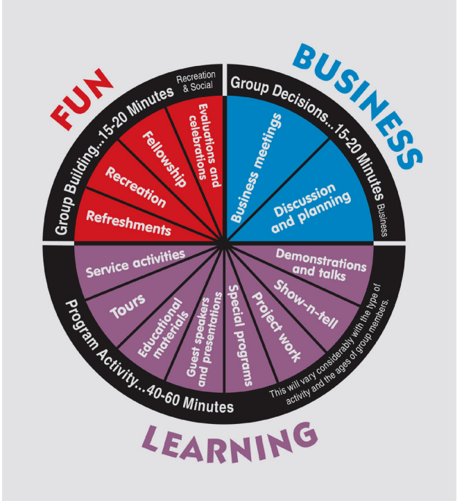
The 4-H Meeting Wheel.

• Business Sessions. The business portion of the meeting should be short and snappy. It is a small democracy in action with members learning how to conduct meetings effectively, work with others through committee assignments, and cooperate with others in making decisions.