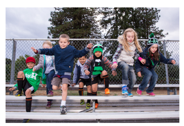
The youngest 4-H'ers: Coverbuds, ages 5 to 7 .

The 4-H colors are green and white. Green is nature's most common color and represents life, springtime, and youth. White symbolizes purity.