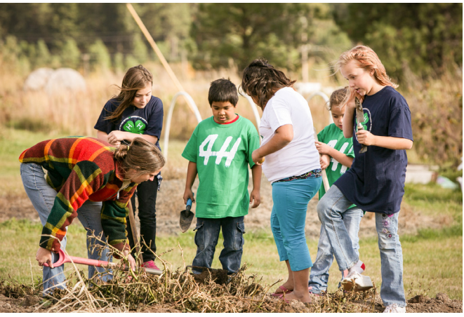
4-H Afterschool garden, Worley.

• 4-H'ers do better work when they receive more personal attention from parents and volunteers.