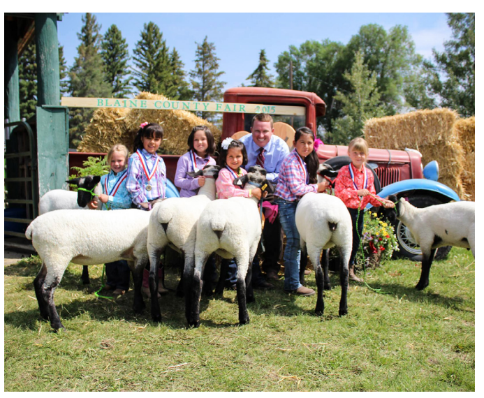
Showing off livestock projects at the fair.

• 4-H Ambassadors . The 4-H Ambassador program develops leadership and public speaking skills in older 4-H members, enabling them to become more effective 4-H advocates within their communities and counties.