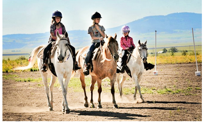
4-H horse project members, Idaho County.

• Refreshments . Some clubs serve refreshments at meetings, although this is not essential. Usually different families serve as hosts each month, providing members experience in selecting, preparing, and serving the refreshments. Emphasis should be placed on selecting simple, inexpensive, nutritious refreshments and how to serve them. Parents should help by giving suggestions and guidance.