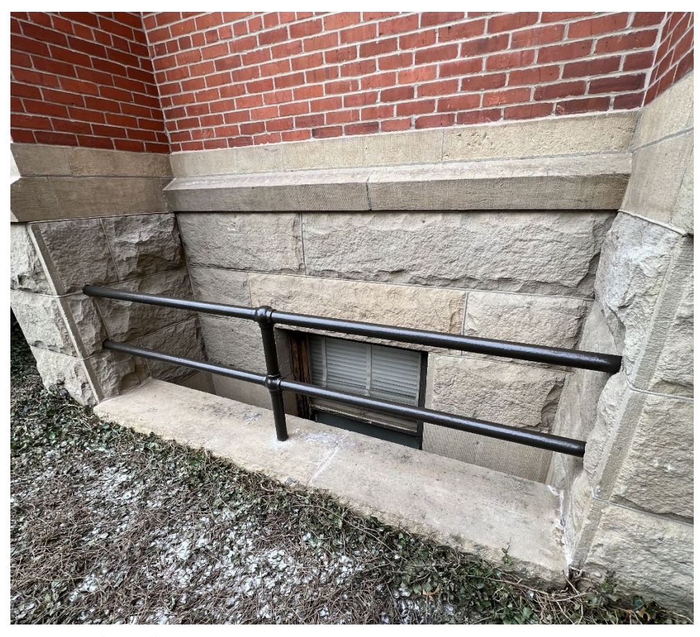
Figure 1 Window well

CSHQA Architects is the project architect.