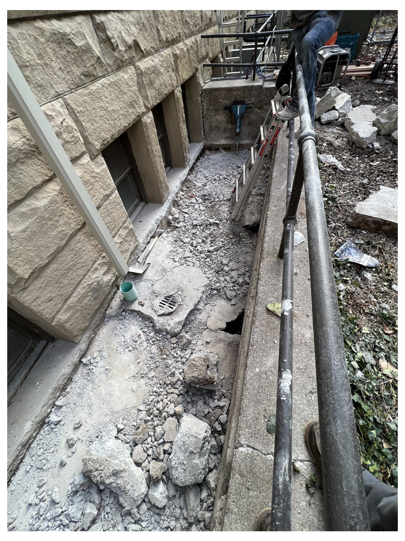
Figure 3 Window well