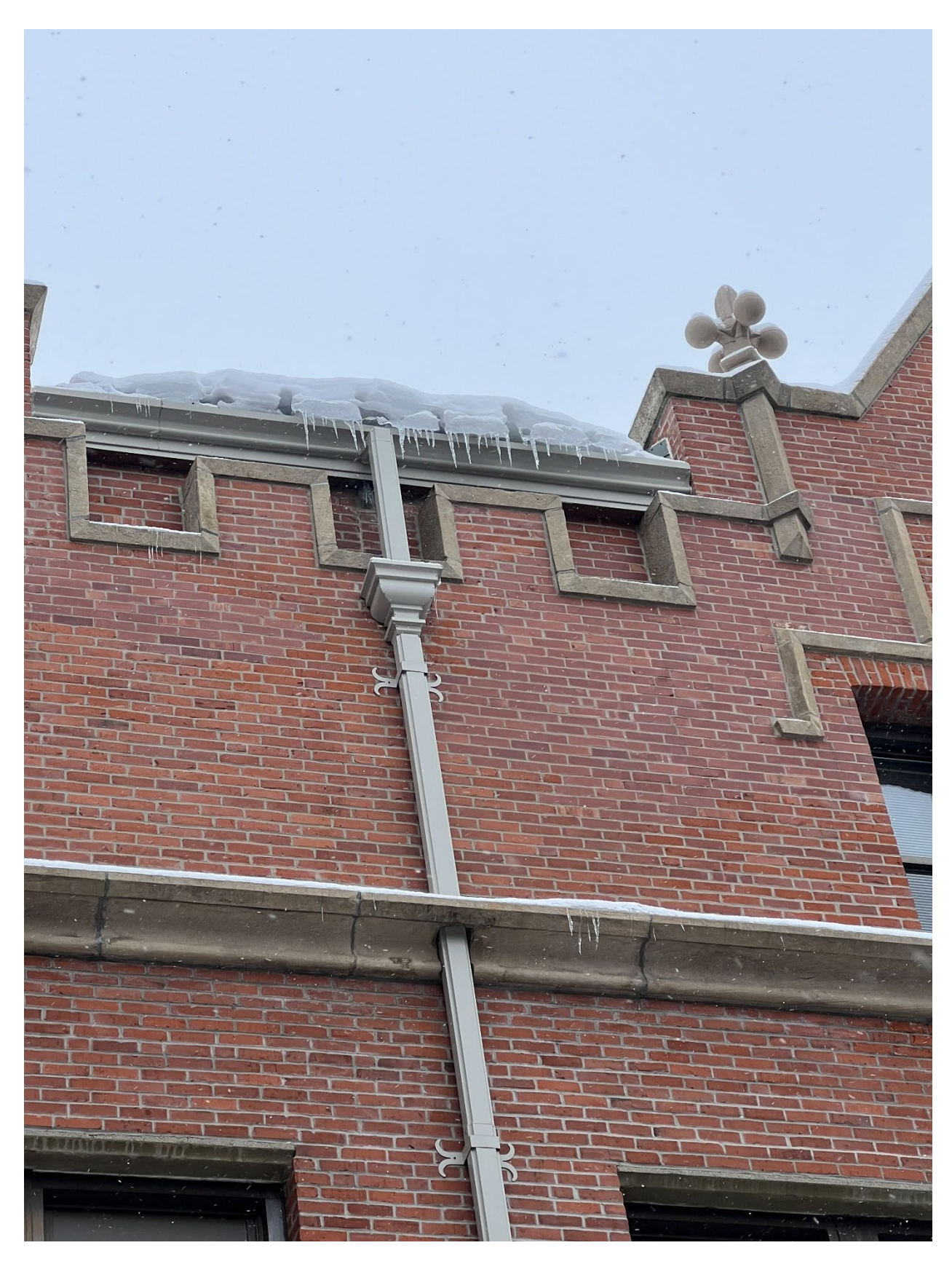
Figure 4 Roof & finial